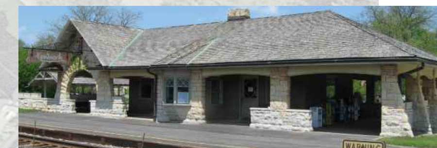
Burnham's Train Station

Pavilion / Concessions Building - 32' x 20' - Wooden Pavilion with Stone Columns to Match Burnham's Train Station - 2 Restrooms - Picnic Tables