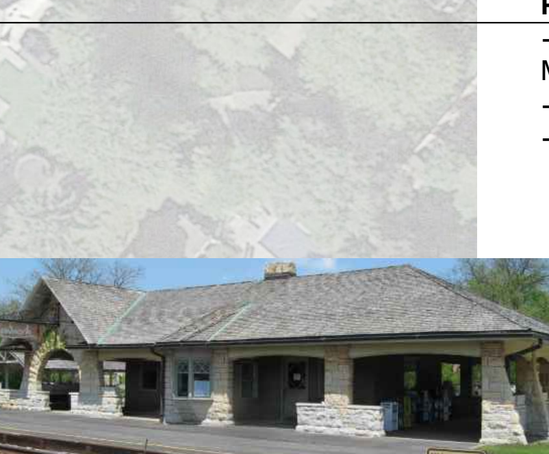
Burnham's Train Station